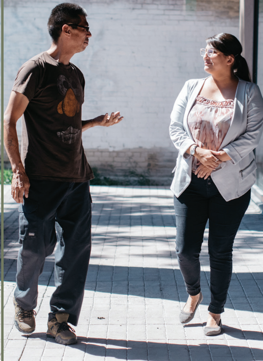
Inner-city education hub for low-income adults pursuing post secondary education.

Jubilee Investment Certificates (JICs) are based on a GIC investment model, but JICs focus primarily on the social return and secondarily on the financial return on investment.