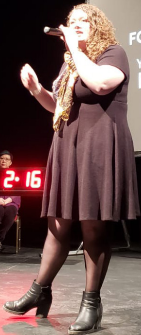
Jubilee Fund team member presenting at Fast Pitch.

Operational expenses are supported through grants, donations, the sale of Jubilee Fund memberships and waived interest from Jubilee Investment Certificates (JICs). Loan funds are raised through Jubilee Investment Certificates (JICs).