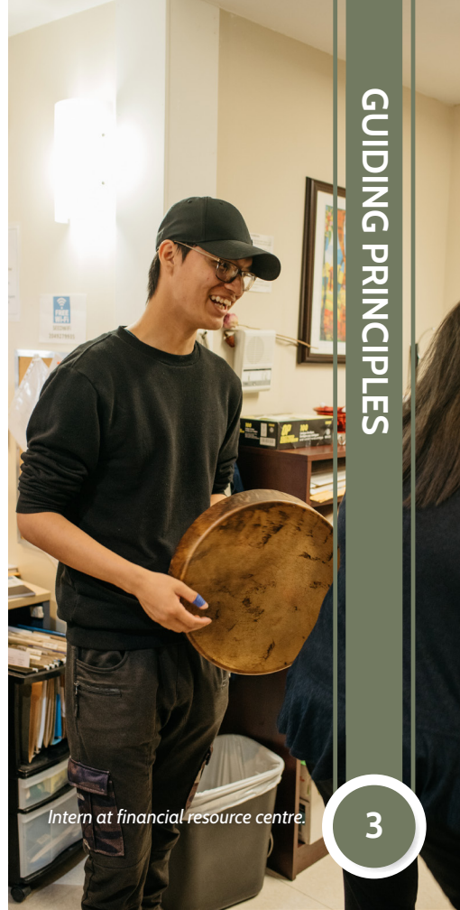
Intern at financial resource centre.