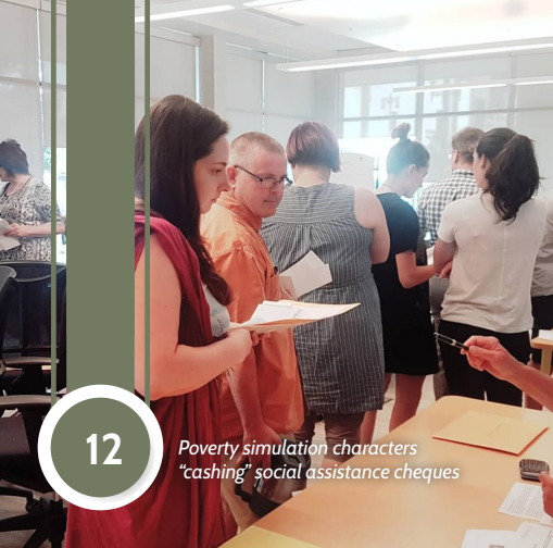
Poverty simulation characters "cashing" social assistance cheques