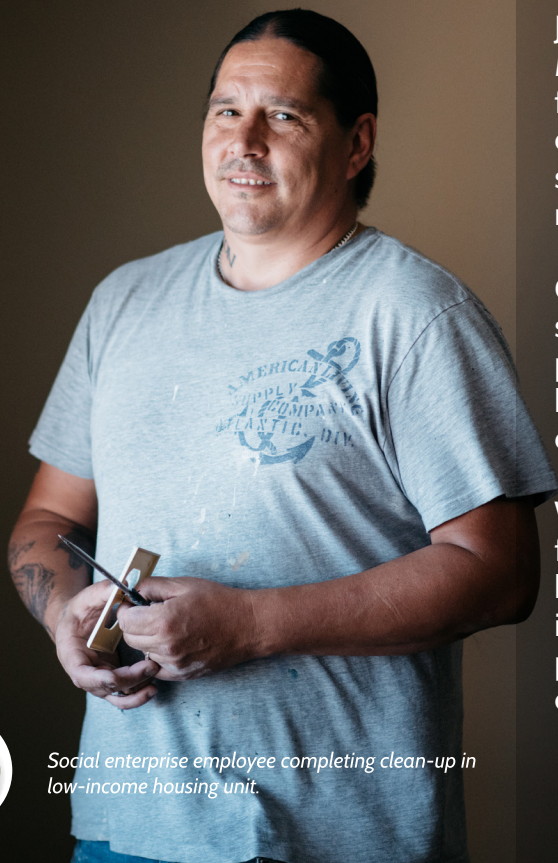
Social enterprise employee completing clean-up in low-income housing unit.

Jubilee Fund, launched in 2000, is Manitoba's only charitable ethical investment fund. We provide Manitobans with the opportunity to invest in Manitoba—creating support for social impact partners working to make our province stronger.