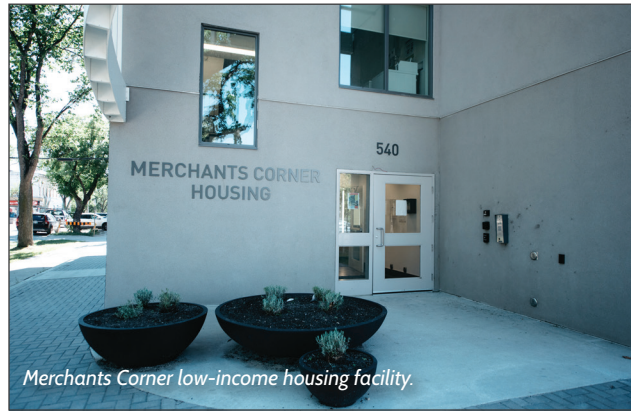
Merchants Corner low-income housing facility.

Donations can be made through Canada Helps or sent directly to Jubilee Fund.