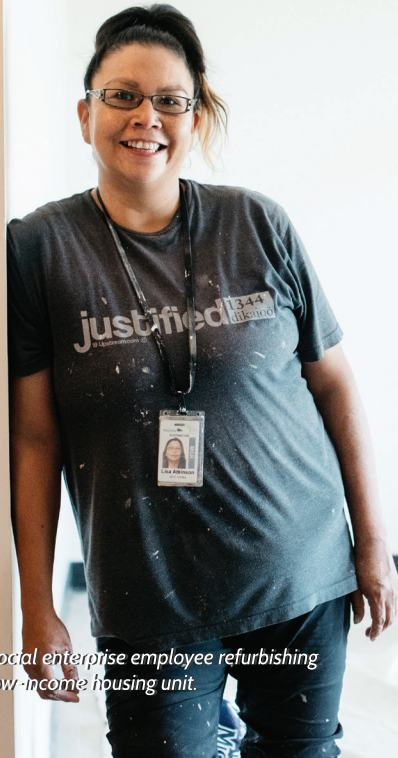
Social enterprise employee refurbishing low-income housing unit.

Text “JUBILEEFUND” to 22828 to join our mailing list and receive updates on upcoming events and news.