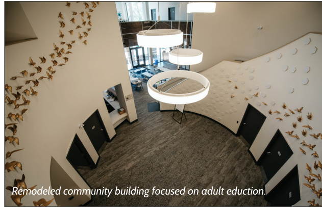
Remodeled community building focused on adult education.