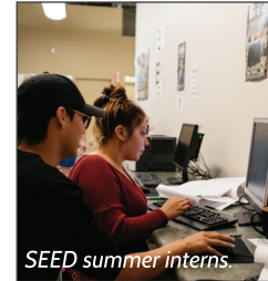
SEED summer interns